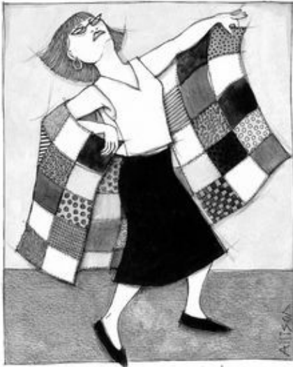
Cecily transcended time and place as she danced the dance of the patchwork quilt.