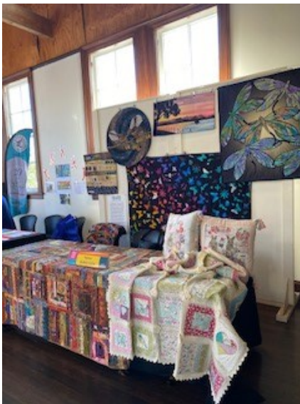
Our display at Founders.